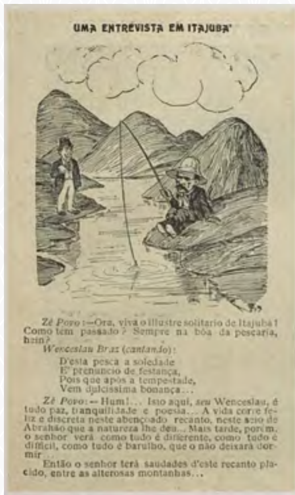
O Malho magazine of 8.9.1913, Rio de Janeiro, year 12, No. 569, page 25.

Despite the difficulties of the period, Wenceslau Brás finished his mandate having dealt with them in a shy and timid manner. For many journalists and writers of the age, his presidency was not distinguished by any notable traits. His failures, intellectual mediocrity and lack of literary culture were highlighted in the chronicles of the time, so that, although he could not be remembered for the competence of his administration, his reclusive nature was immortalized in the cartoons and caricatures of the main Rio de Janeiro newspapers of the period.