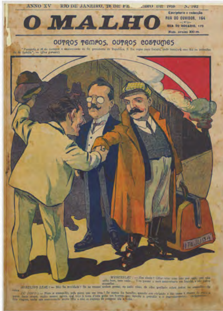
O Malho magazine of 2.26.1916, year 15, No. 702, cover.