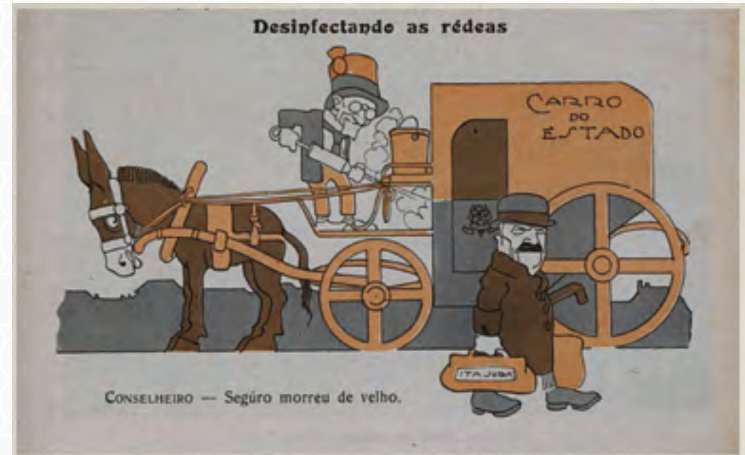
A Careta magazine of 11.16.1918, page 11.