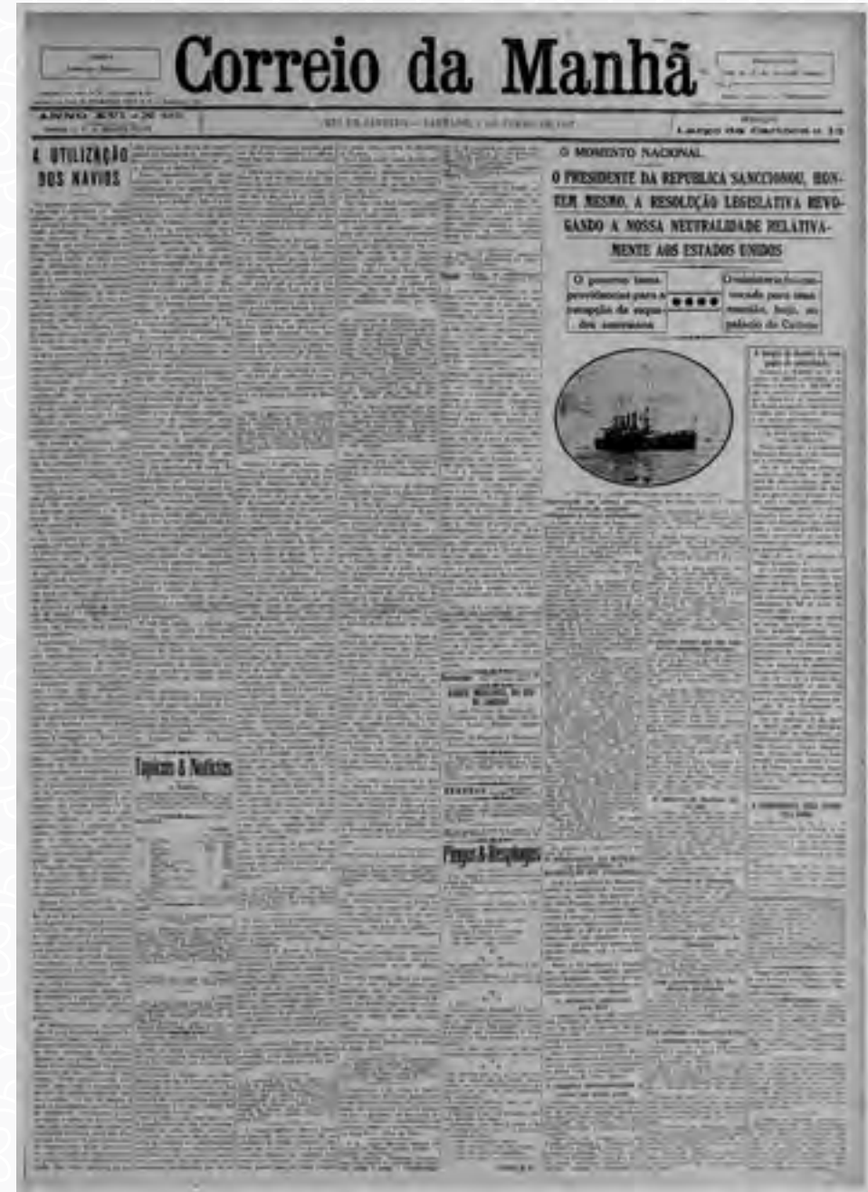
Front page of the Correio da Manhã newspaper of 6.2.1917, announcing the president's approval of the law that declared war on the countries of the Triple Alliance.

It was also during the presidency of Wenceslau Brás that Brazil declared war on Germany, albeit only three years after war had begun in Europe, and without Brazil ever engaging in combat. The argument was that the nation's forces should be preserved for a possible German attack on Brazilian soil. However, the real reason was the country's complete lack of military preparedness and its limited and outdated arsenal.