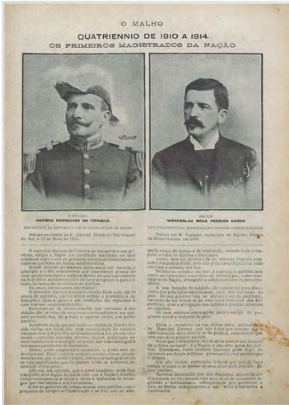
This text published in O Malho magazine of 11.19.1910 presented the manifesto of the Hermes da Fonseca – Wenceslau Brás slate. Collection of the Fundação Biblioteca Nacional – Brazil.

Although this was a turbulent period, the tenure of Wenceslau Brás as vice-president was portrayed by the press in Rio de Janeiro as the most unremarkable in the history of the Republic. He was a frequent target of satirical cartoons that emphasized his provincial spirit and the circumspect nature of the Solitary Man of Itajubá , as he was known. His manners and temperament remained a longstanding matter of discussion among those eager for the dynamism and cosmopolitanism promised by the advent of the Republic, especially in Rio de Janeiro, the cultural capital of Brazil in the belle époque .