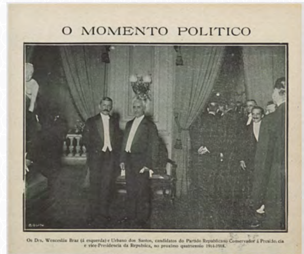
Photograph published in Fon-Fon magazine of 12.20.1913 showing the candidates for president and vice-president of the Republic.

Although this was a turbulent period, the tenure of Wenceslau Brás as vice-president was portrayed by the press in Rio de Janeiro as the most unremarkable in the history of the Republic. He was a frequent target of satirical cartoons that emphasized his provincial spirit and the circumspect nature of the Solitary Man of Itajubá , as he was known. His manners and temperament remained a longstanding matter of discussion among those eager for the dynamism and cosmopolitanism promised by the advent of the Republic, especially in Rio de Janeiro, the cultural capital of Brazil in the belle époque .