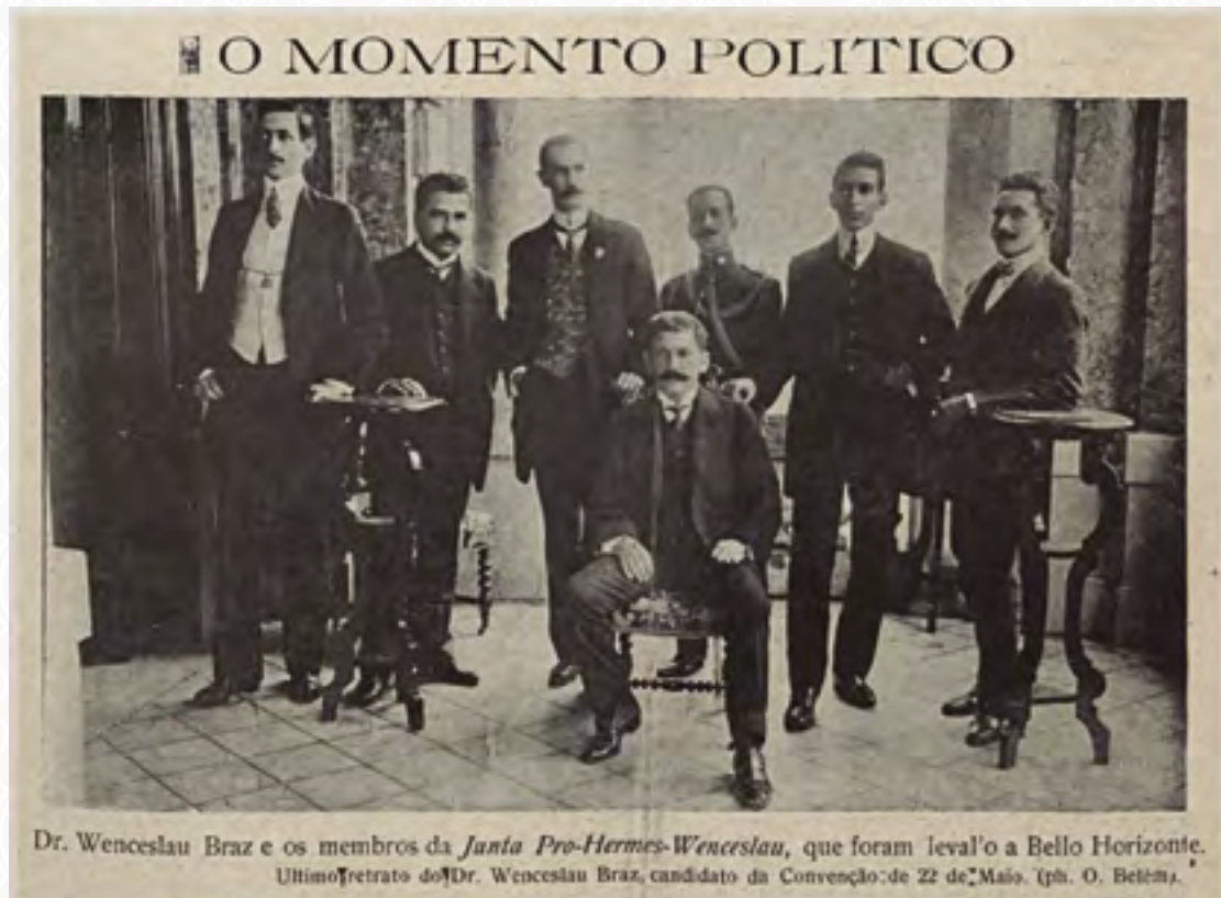
Fon-Fon magazine of 2.12.1910, page 11.

The news of the time reports that the election of Hermes da Fonseca in 1910 took place amid great political turmoil—much like his presidential term, which lasted until 1914. The difficulty of maintaining public order would be the defining characteristic of this administration, in which Wenceslau Brás served as vice-president and, by virtue of this role, as president of the Federal Senate.